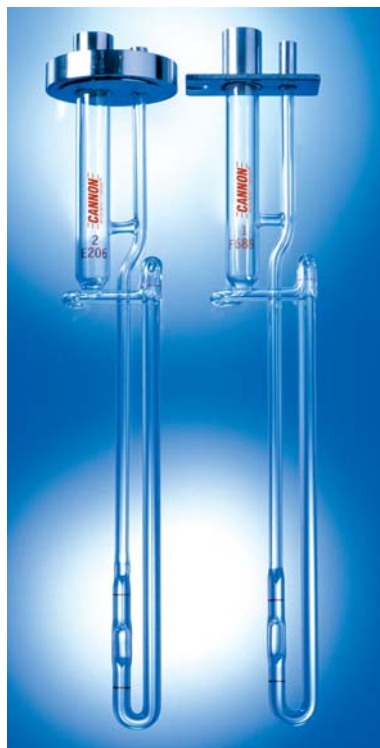
9723-W50 Series 9723-Y50 Series 9724-B50 Series 9724-D50 Series

Similar to 9724-B50 series, but have constant within ± 0.2% of value listed in table on page 9.