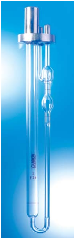
9723-A50 Series 9723-B50 Series