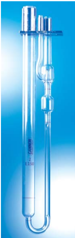
9723-C50 Series 9723-D50 Series

Similar to 9723-B50 series, but uncalibrated.